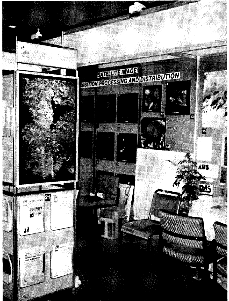
ACRES Display Stand — 5th Australasian Remote Sensing Conference

Some time ago, the Department of Industry, Technology and Commerce (DITAC) awarded British Aerospace