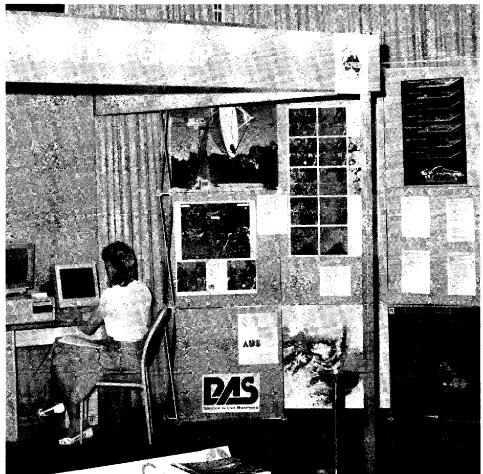
ACRES Display Stand — AURISA Conference